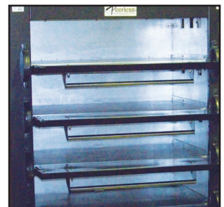
Adjustable Dampers at each deck