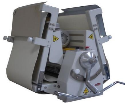
Easily folds to save space when not in use

BMCRS01 Belt Dimensions: 17" Wide x 67" Long