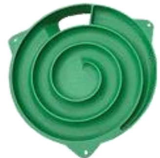
Includes 3 Moulding Plates

** Due to continuous product improvement, specifications are subject to change without notice.