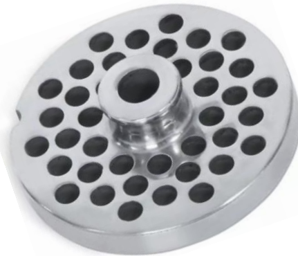
2 Plates Included (5mm & 8mm) Additional Accessories Available Upon Request

** Due to continuous product improvement, specifications are subject to change without notice.